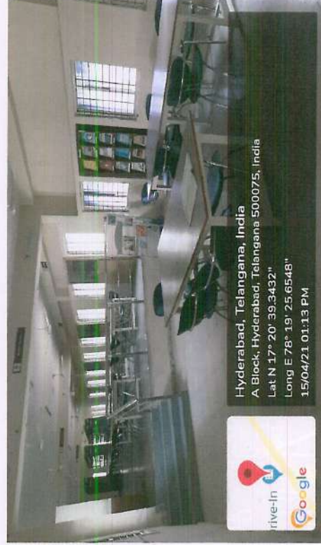
Reference Section in Library