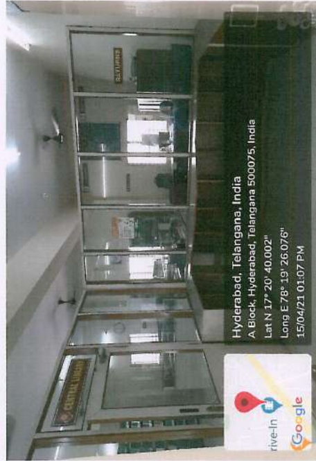
Issue and Return Counter