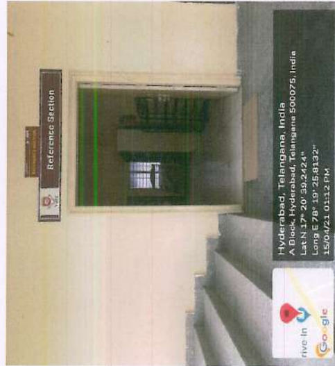
Reference Section Entrance