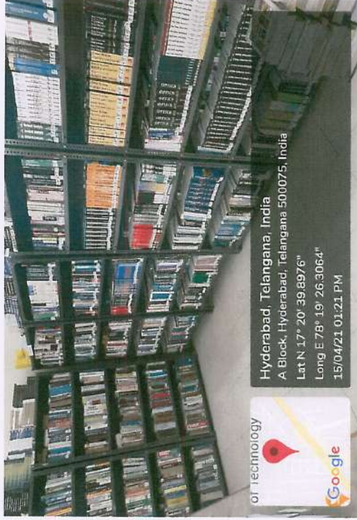
Book Shelves in Library