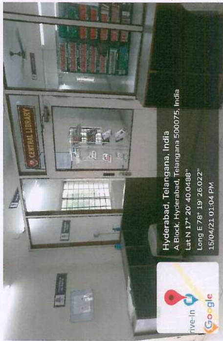
Entrance of Central Library