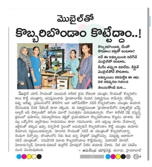
Team "Coco Kasaya" Won the I Prize at the "Project Competition" conducted by ICTIEE-2020 JNTUH, Hyderabad.