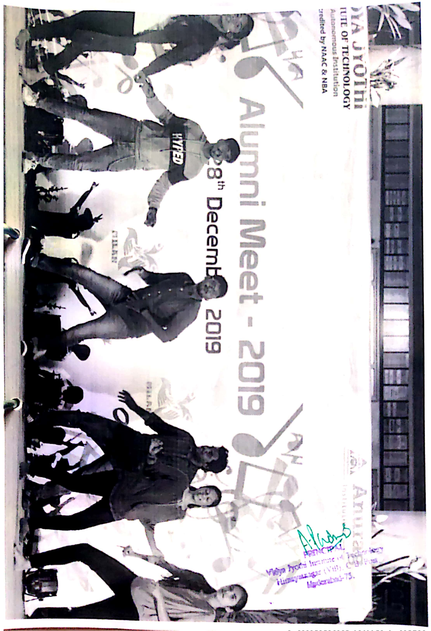
scanned with Camsca