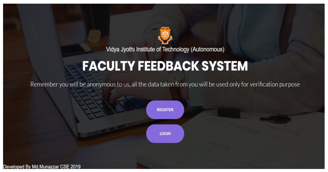
Login web page screenshot