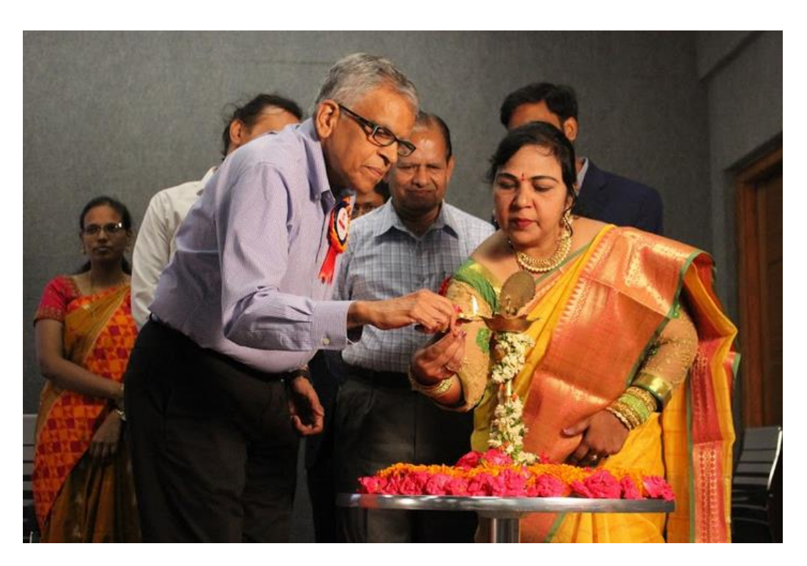
Opening Ceremony with Lightening Lamp