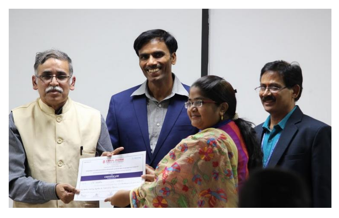
Certificate Distribution to the Paper Presenters