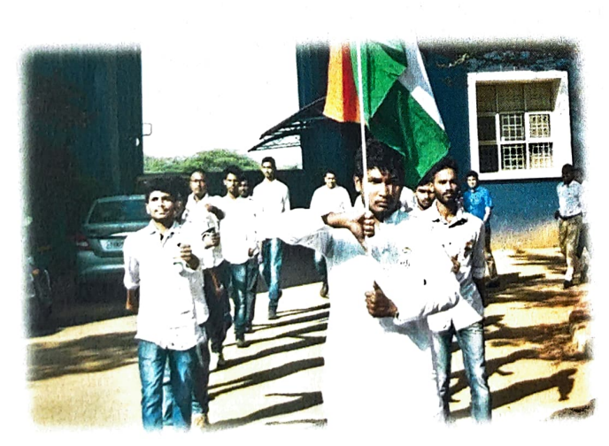
Parade by NSS Students

. The Day was ended by Cultural Events and vote of thanks.