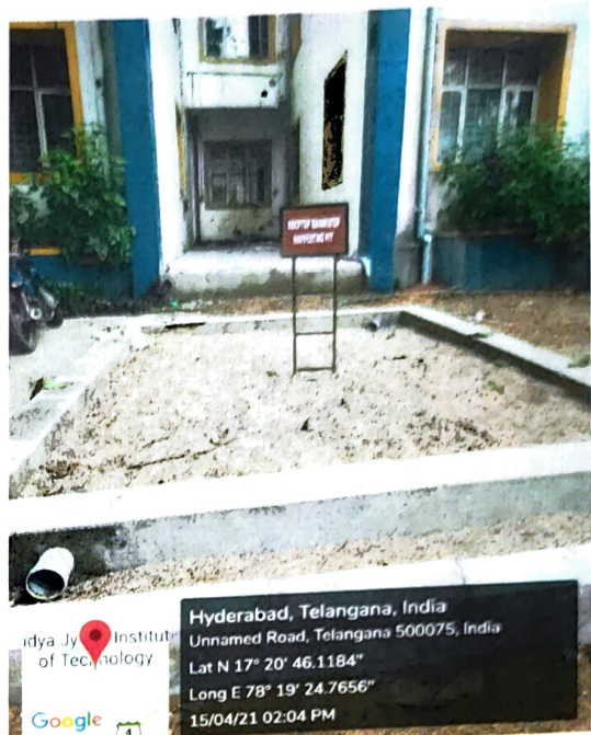
Vertical dimensions filtering media of Roof top Rain water Harvesting Pit