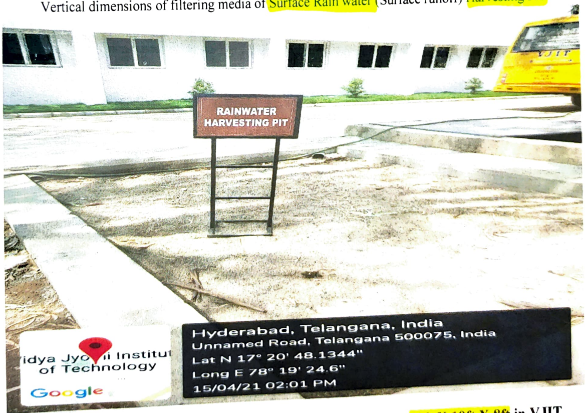
Surface Rain Water (Surface runoff) Harvesting Pit of Size 10ft X 10ft X 8ft in VJIT, Hyderabad Campus