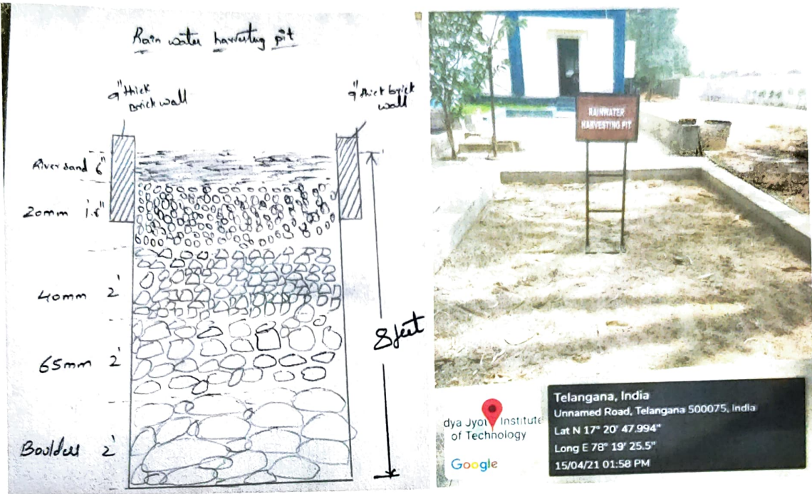
Vertical dimensions of filtering media of Surface Rain water (Surface runoff) Harvesting Pit