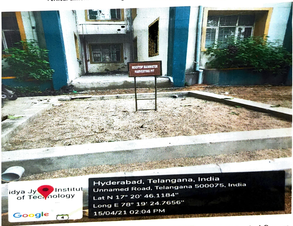
Roof top Rain Water Harvesting Pit of Size 10ft X 10ft X 8ft in VJIT, Hyderabad Campus