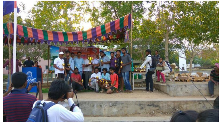
JNTUH Zone-C Volleyball Winner's-2017