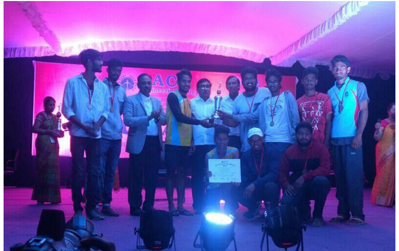
ACE ENGG.COLLEGE VOLLEYBALL WINNERS-2017