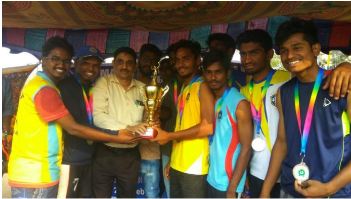
JNTUH ZONE-C Volleyball Winners 2018

Aziznagar Gate, C.B. Post, Hyderabad-500 075