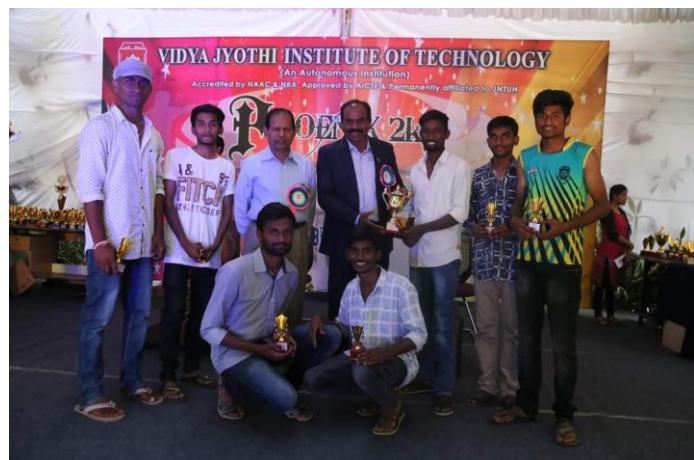
VJIT National Level Sports Fest'2018 Volleyball Winners