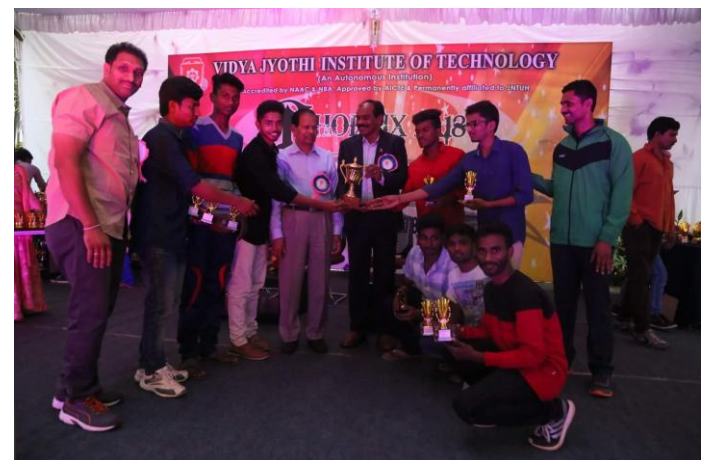
VJIT National Level Sports Fest'2018 Kabaddi Winners