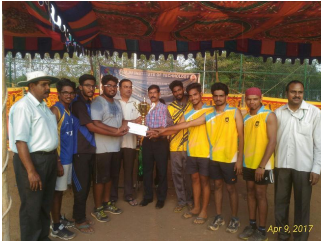
Dr.B.V.R.I.T Volleyball-WINNER'S 2017

Aziznagar Gate, C.B. Post, Hyderabad-500 075