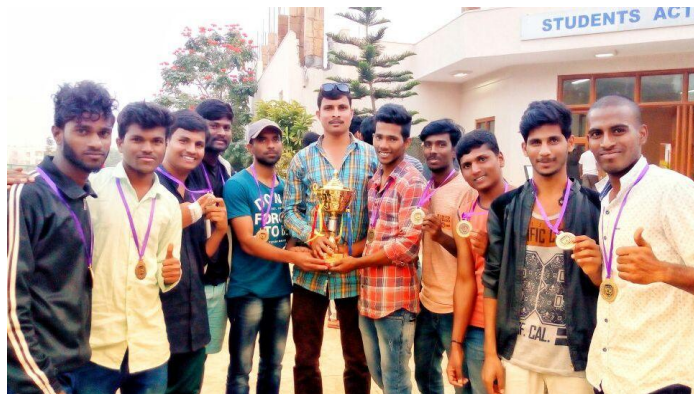
SAKSHI KABADDI TOURNAMENT WINNERS'18