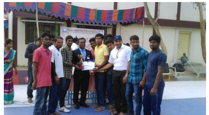
CBIT SPORTS MEET'17 KABADDI