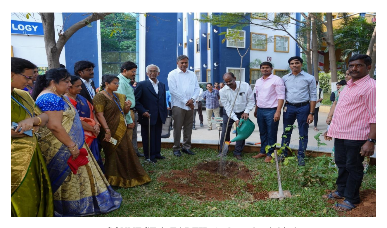
CONNECT-2- EARTH: A plantation initiative