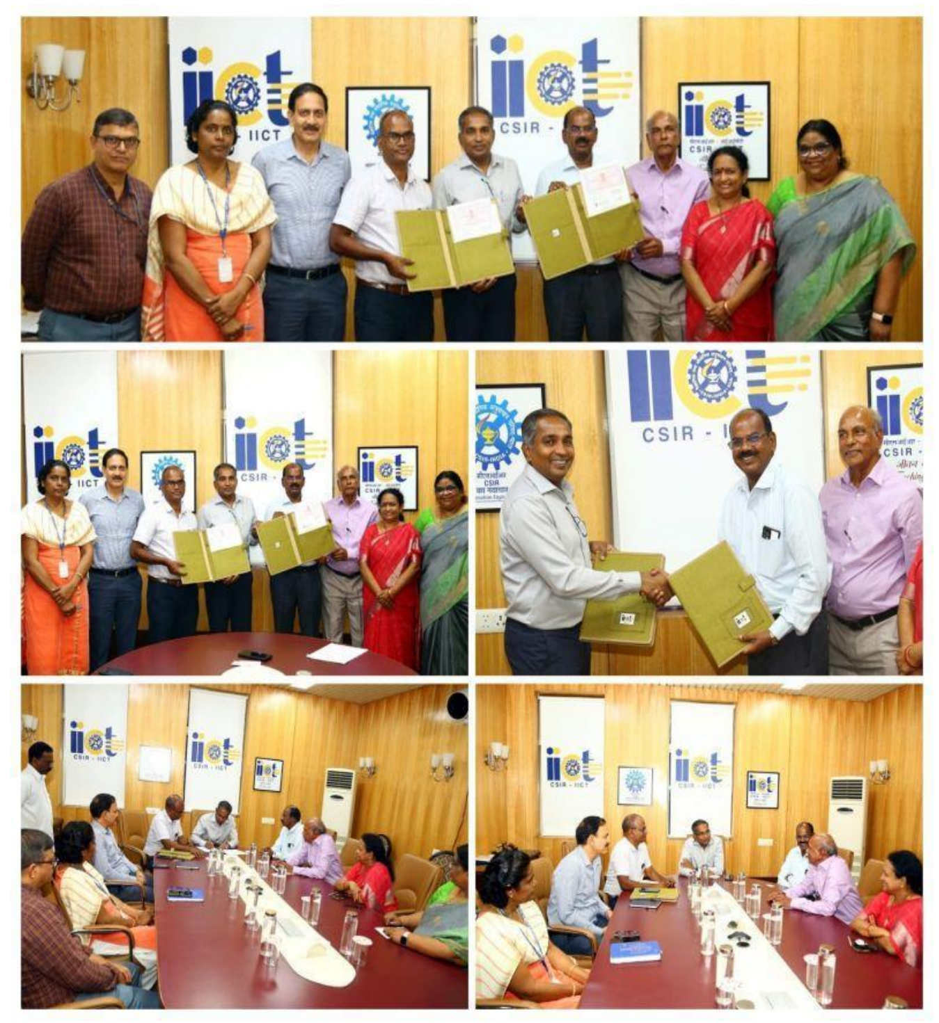
MOU BETWEEN VJIT AND IICT.