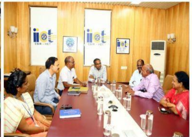
MOU BETWEEN VJIT AND IICT.