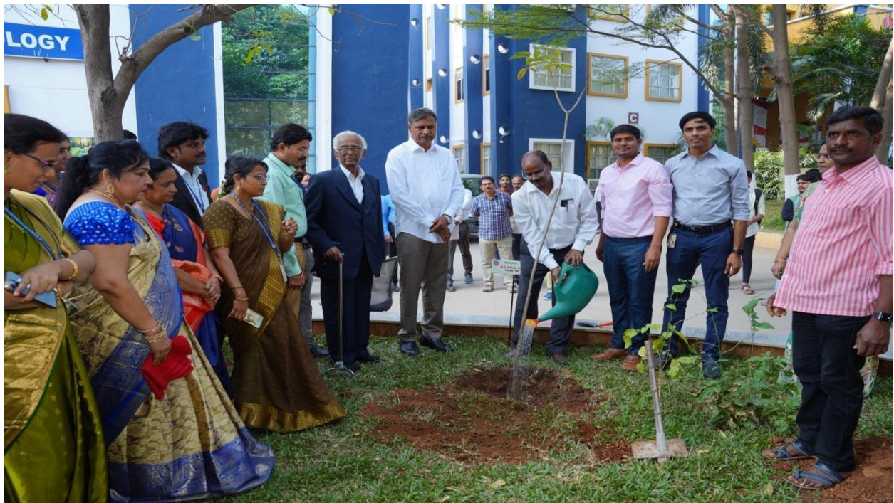
CONNECT-2- EARTH: A plantation initiative